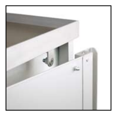
► Doors can fold wide open and are secured with magnetic fixing