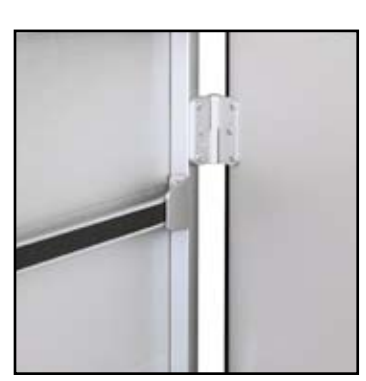
► Steering handle