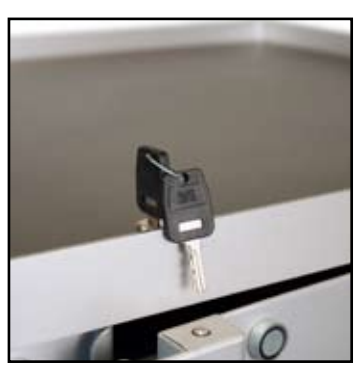
► Lock on top shelf protected against bumps